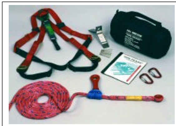
FALL PROTECTION KIT

NOTICE: Photos are provided for general information only. Fall protection equipment must be matched for compatibility of each component with the others. Anchors require special placement and special fasteners. Users of fall arrest systems require specialized training. Consult with OSHA 1926.500, 501, 502, 503 and appendicies.