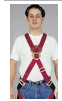
TYPICAL BODY HARNESS